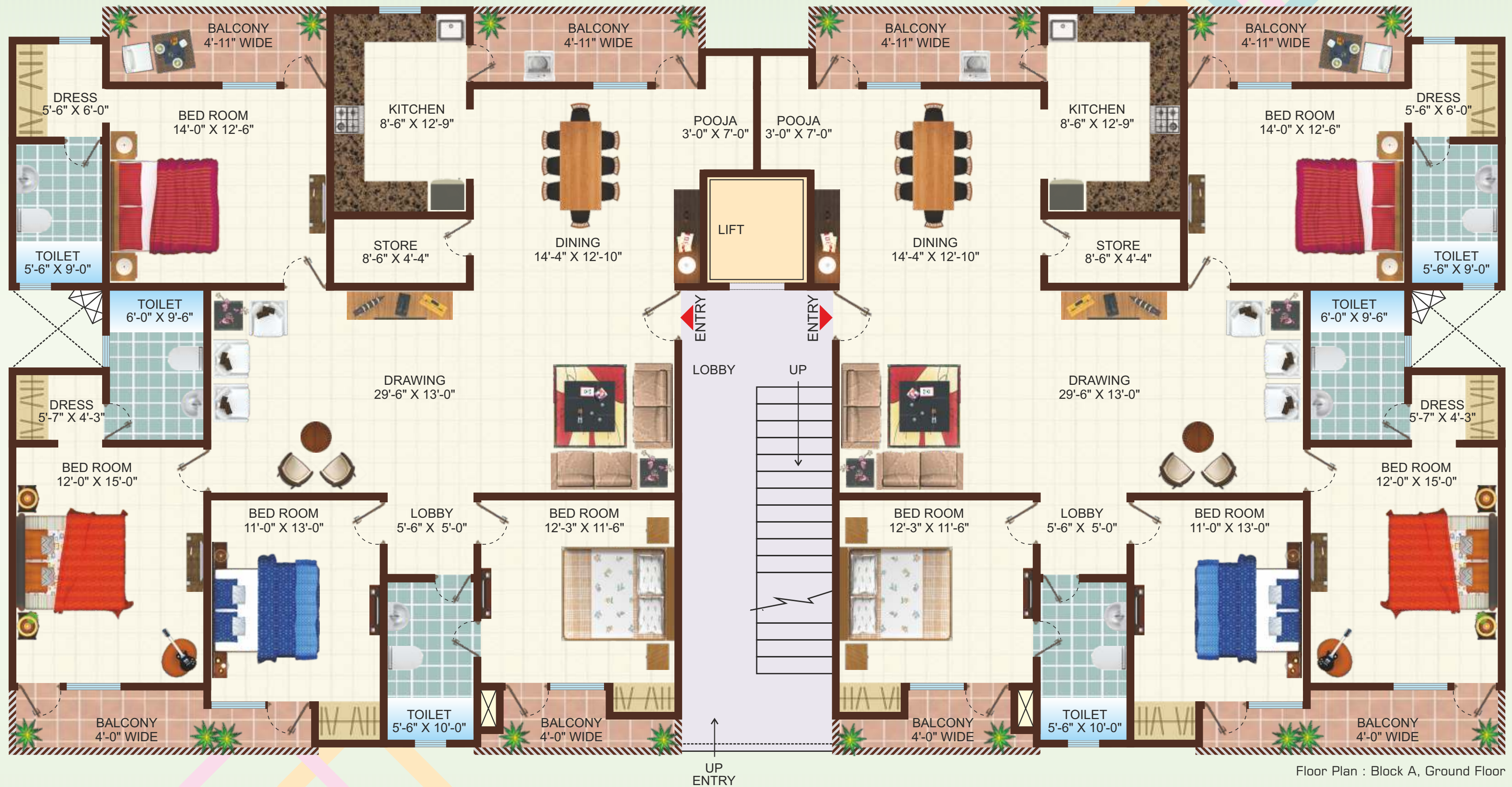
Floor Plan : Block A, Ground Floor