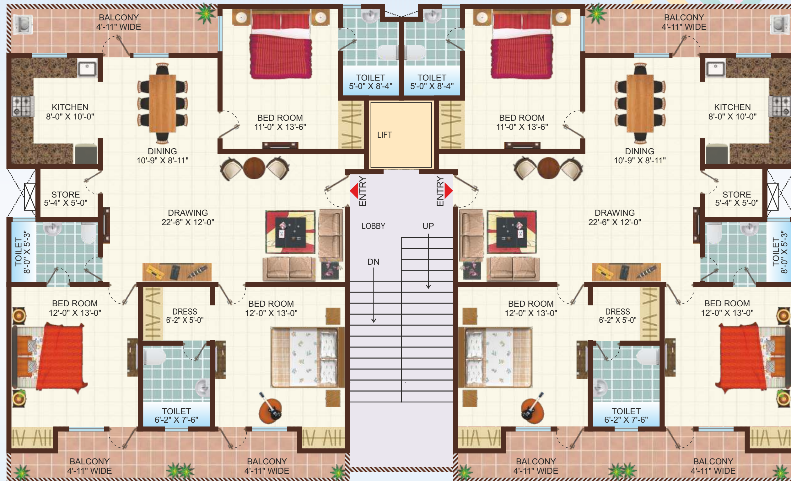
Floor Plan : Block B, First Floor to Fourth Floor