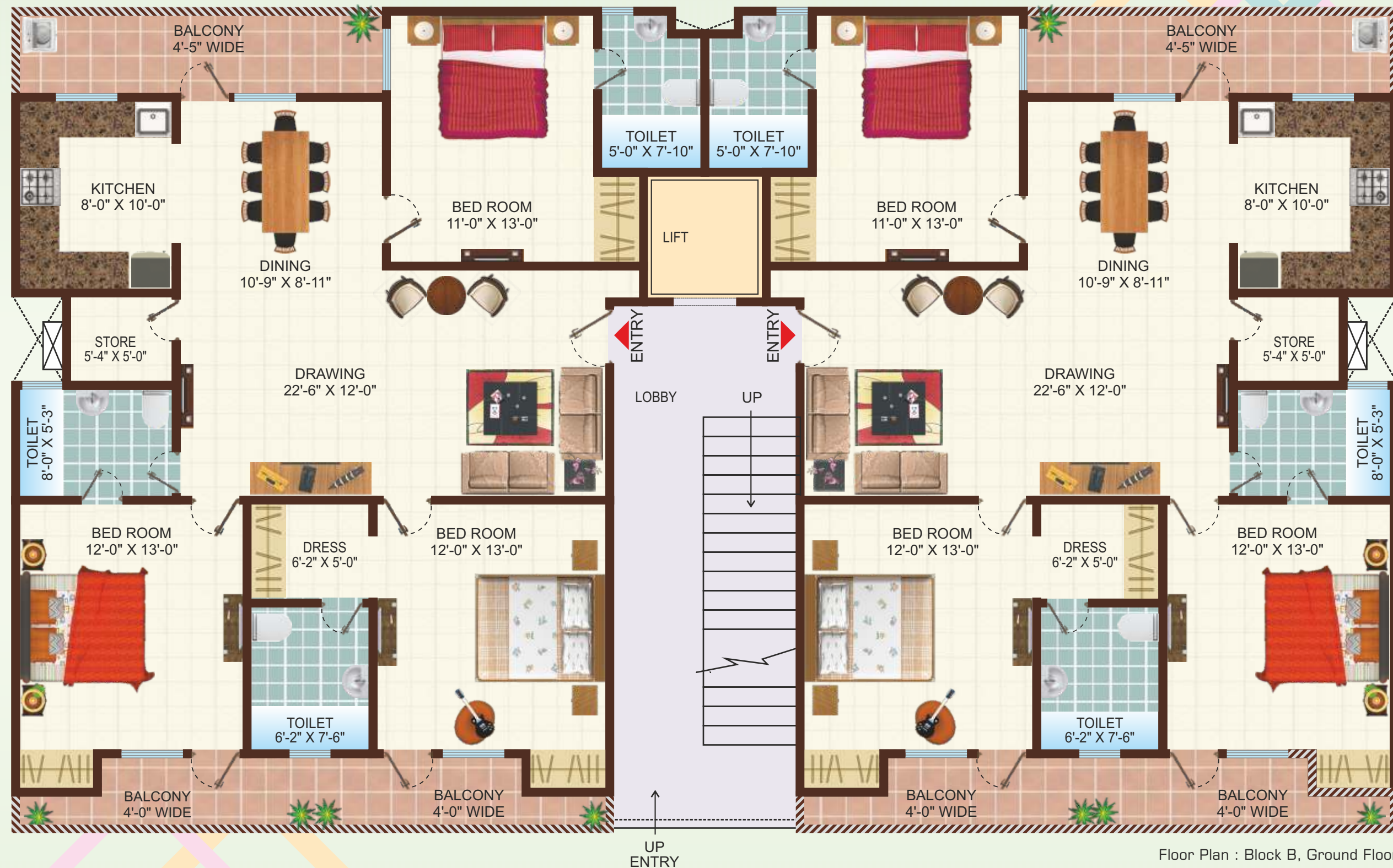
Floor Plan : Block B, Ground Floor