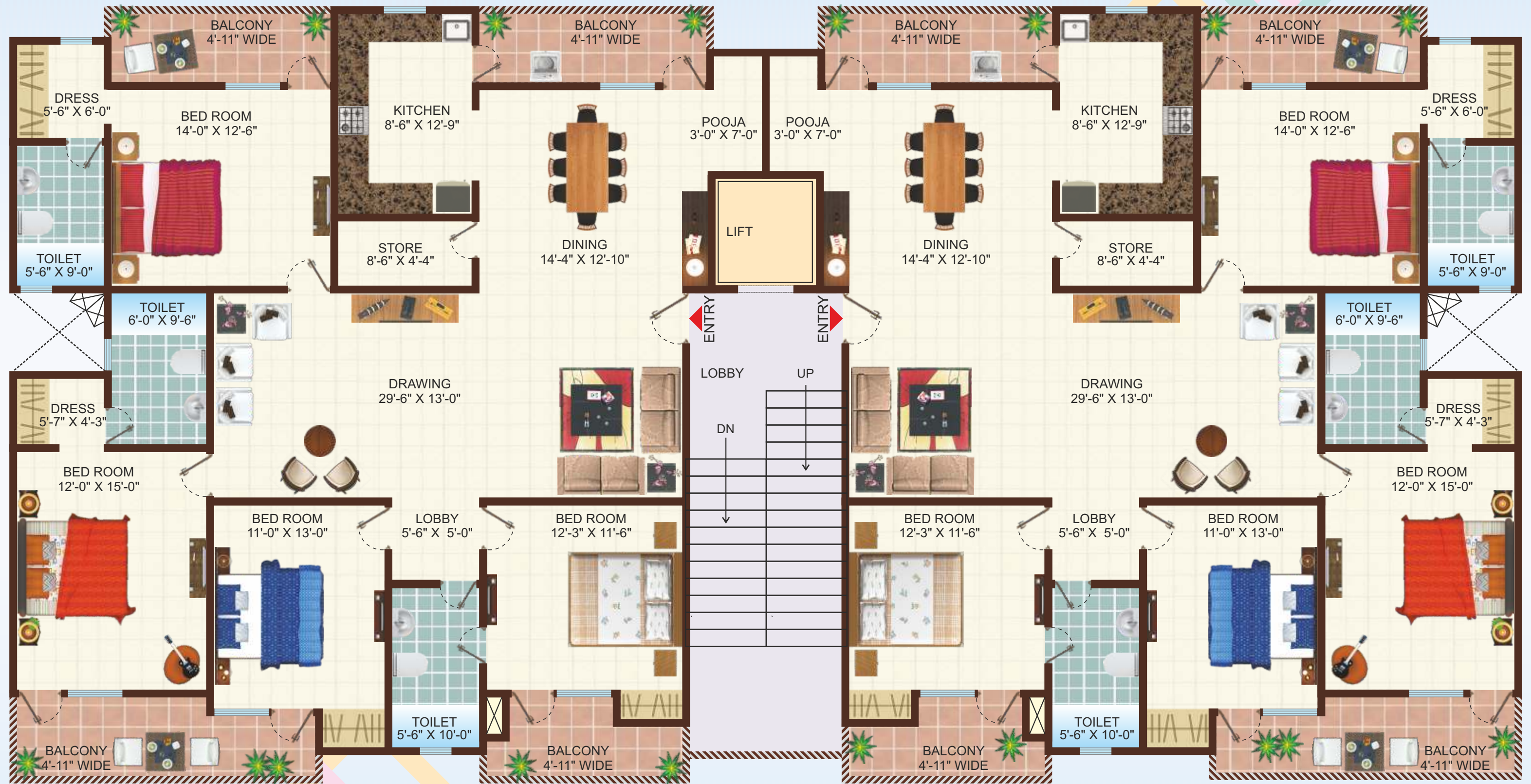
Floor Plan : Block A, First Floor to Fourth Floor